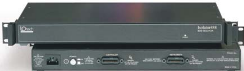
Electrically isolate instruments on the IEEE bus with Isolator488

Isolator488™ allows electrical isolation between devices on an IEEE bus by the use of opto-isolators on all the IEEE bus lines. Isolator488 does not occupy an address on the IEEE bus and is completely transparent to the system. The unit's isolation rating is a full 1500V, unlike typical IEEE bus expanders which offer only 20 or 30V isolation.